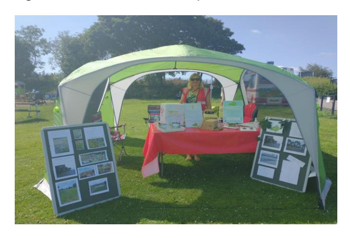
Friends of Breck Hill Park information stand at the Picnic in the Park July 2021

In addition to formal sports matches being played on the grounds there are also regular informal practice sessions throughout the week all year round. It has therefore been assumed that there are in excess of 30,000 park users per annum, a figure that will continue to expand with increased facilities, improved access and egress and events in the park.