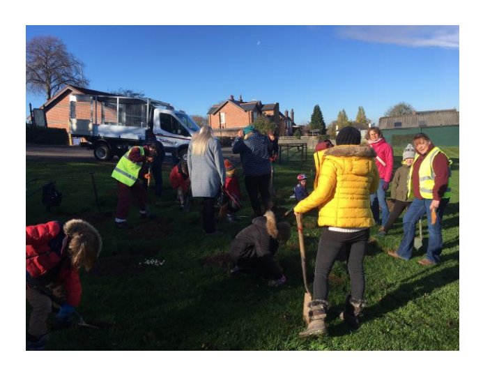
Community Bulb Planting

encouraging new users about the value of the park as a recreational and educational resource on their doorstep. The park webpage is a really useful information page to those residents new to the area and searching for recreational facilities nearby.