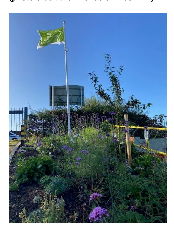
The Nectar bed – entrance off Woodthorpe Drive