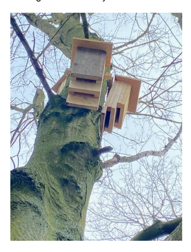
Above Bird and Bat Boxes installed on the park

provided by Greenwood Greater Nottingham later this year.