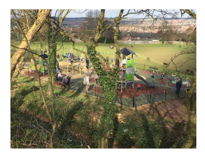
Refurbished Play Area February 2021

event, the 'Picnic in the Park' event in July 2021.