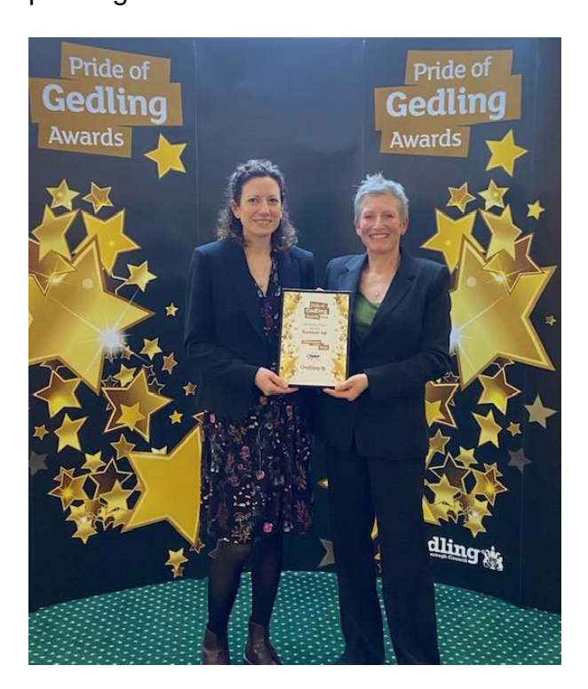
Friends group members collecting their runner up certificate in the Pride of Gedling Awards for Environmental volunteering

pavilion, benches, railings and gates and the ground preparation for the hedge planting.