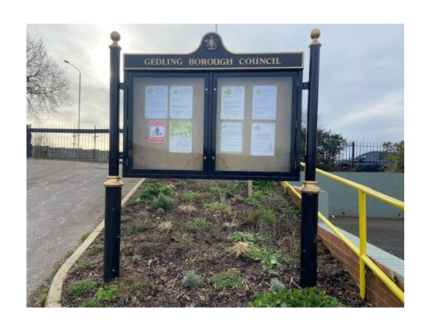
The Notice Board installed 2023

Although the status of the park and what it offers does guide the nature and content of events and activities, we are working hard on promoting the park to the local and wider community through council marketing material, Green Flag & Love Parks webpages, press releases and photo opportunities to the local media.