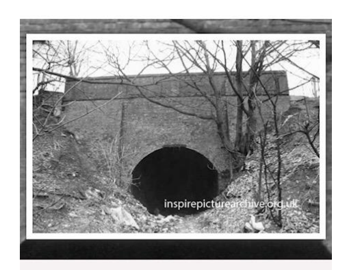
Railway Bridge, Mapperley Brickworks, Woodthorpe Drive, Mapperley, Nottingham, 1979

We are planning to use the historical information and associated photos for inclusion on the Heritage Information Lectern to be produced 2024/25.