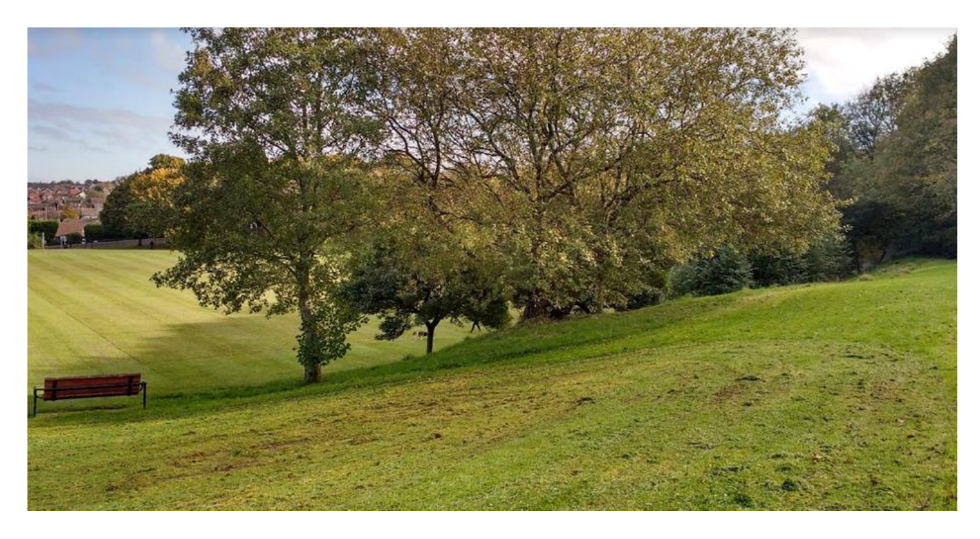
The bank used by local children after snowfall perfect for sledging!

The park's grounds maintenance budget for Breck Hill park for tax year 2024/2025 is £25,000.00.