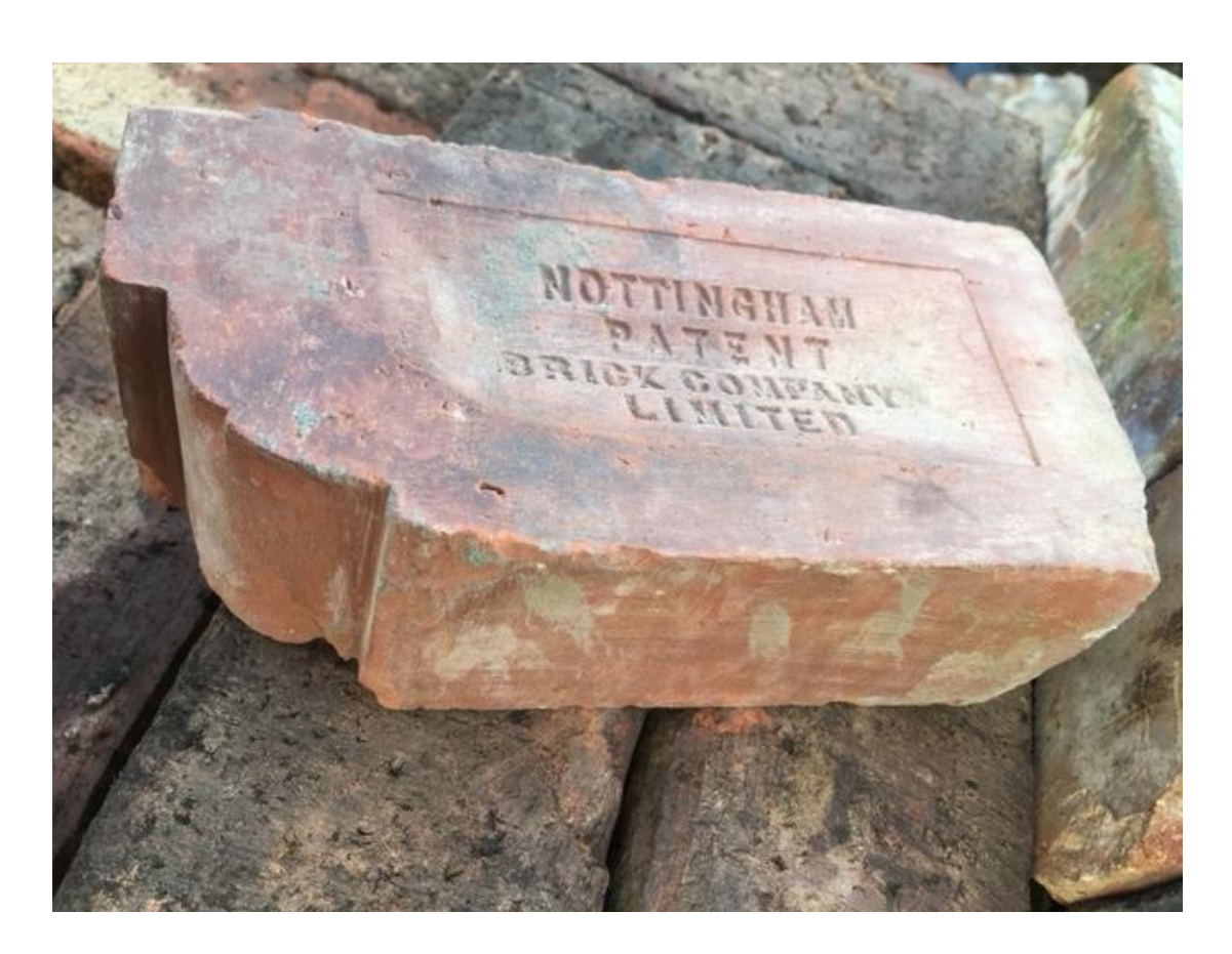
A single brick produced from the old site brickworks