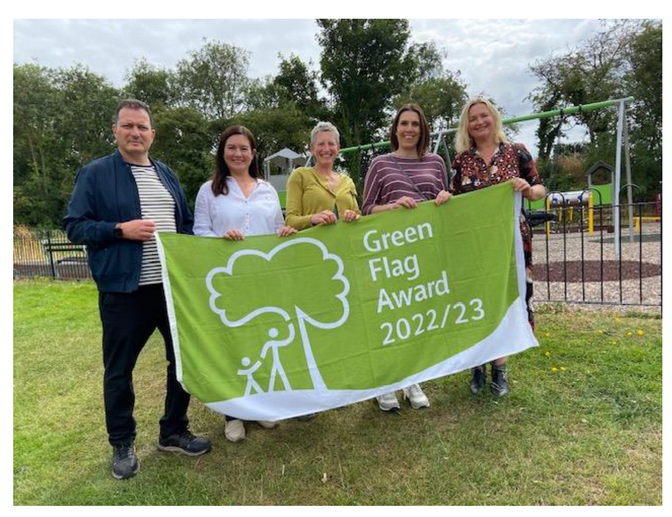
Members of the Friends of Breck Hill Park with the first Green Flag Award 2022