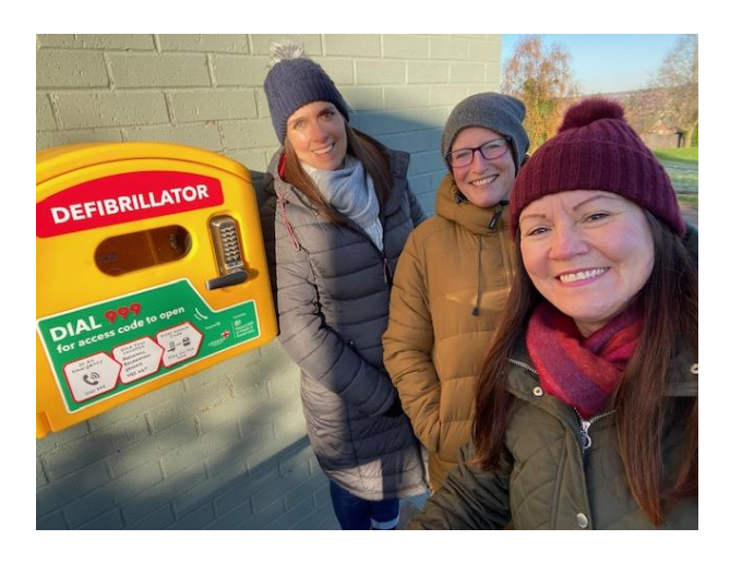
Members of the Friends of Breck Hill with the Defibrillator

In 2023 the Friends group were successful in obtaining a Defibrillator which is now installed on the pavilion building.