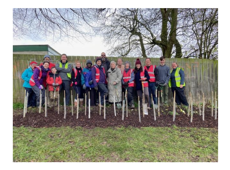
Community Hedge Planting