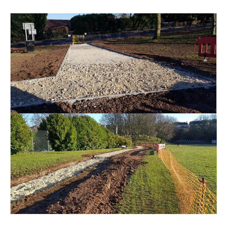
Construction works of the new entrance and footpath from Breck Hill Road January 2024 (works in progress)

In addition, a notice board has been installed which ensures park users are kept up to date with park matters.