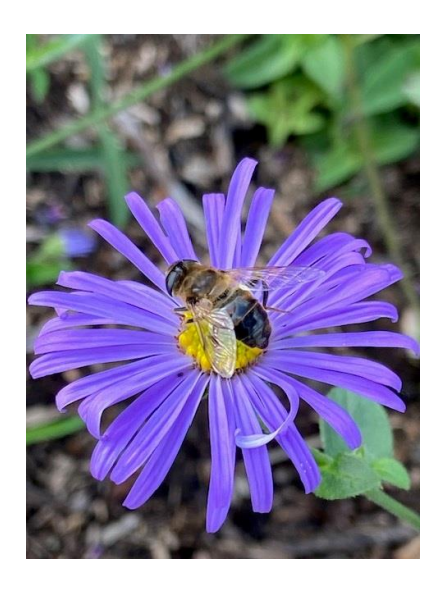
Wildflower Areas