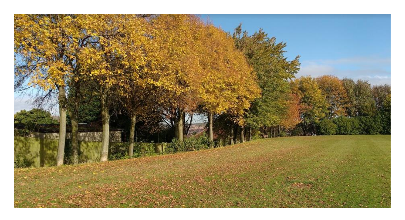
Beautiful Autumn colours on the park