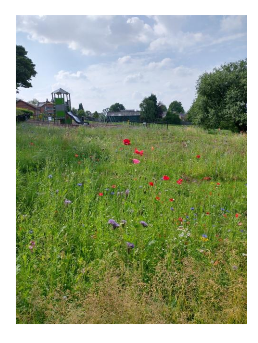
The Wildflower area adjacent to the play area

The parks department do recognise that this form of management not only reduces the need for mechanical maintenance, but also provides habitat and rich nectar for insects.