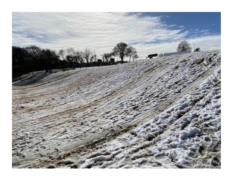
Breck Hill Park – A park for all seasons